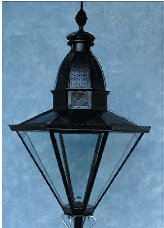
The finished refurbishment, reglazed and repainted, without the additional protection frame that was added later.

Also being remote it does attract vandalism, as the photograph clearly shows. The lantern was removed and sent back to Sugg Lighting for repair and refurbishment, with a brief to add a sympathetic carrying frame to protect the lantern from the extreme winds that it's location has been experiencing over the past few years. Once the lantern had been stripped and repaired new glazing ribs were added which have stainless steel reinforcing rods inside to give additional protection and strength.