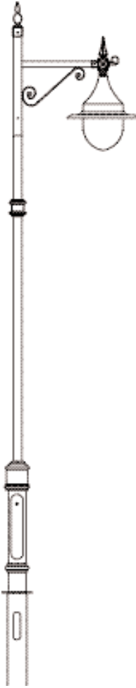
Cannon Light E12