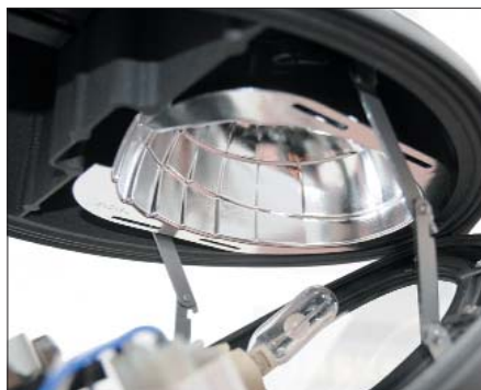
This shows the lower section of the luminaire hinged down to provide easy access to both the lamp and gear, for maintenance.

The project pictured here has used the Wallsend Luminaire mounted onto a 5m column, with a minimum to provide effective uniform illumination for the roadway and the area behind the kerb. The 5m columns have been positioned in a single sided arrangement. The Wallsend provides a performance option for a wide range of road and amenity applications where lighting performance is important and low glare installations a requirement or consideration.